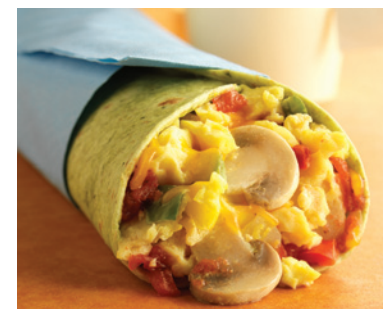
Mushroom and Egg Wrap

“Our breakfast menu is popular year round, but especially during the Spring-time brunch season. We know our guests want healthy, delicious breakfast items, and we often use mushrooms to keep the bold flavors without losing the healthfulness of our dishes.”