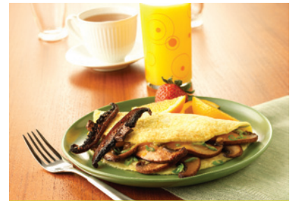
Portabella Omelet with Portabella Bacon

The breakfast daypart is experiencing the most growth and innovation in the foodservice industry, and fresh mushrooms can help enhance the flavor and nutritional profile of the hottest menu trends like ethnic-inspired dishes and breakfast pizzas.